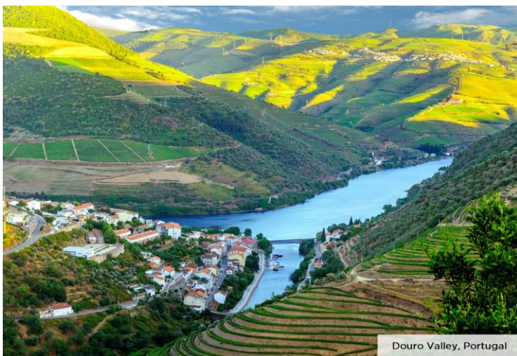
Douro Valley, Portugal

BOOK BY DECEMBER 31, 2024, AND SAVE $1,250.00 PER PERSON, COMPLIMENTARY UPGRADE (SUBJECT TO AVAILABILITY), AND $50.00 PP SHIPBOARD CREDIT.