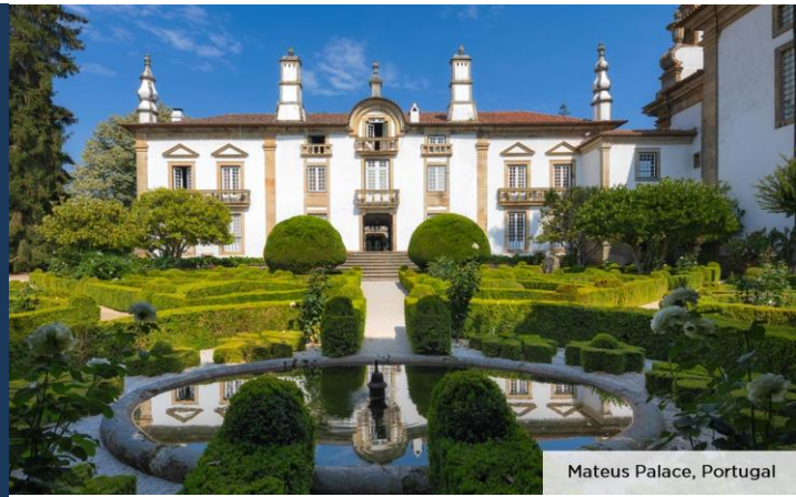
Mateus Palace, Portugal

7-night cruise from Vila Nova de Gaia (Porto) to Vega de Terrón August 22-28, 2026 | AmaVida